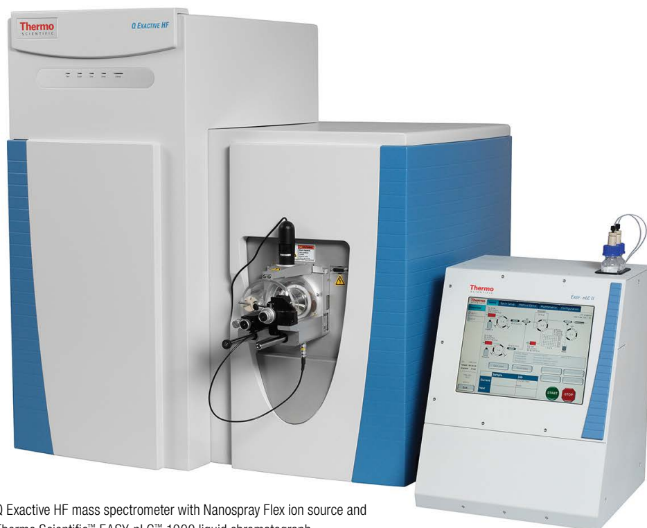
Q Exactive HF mass spectrometer with Nanospray Flex ion source and Thermo Scientific™ EASY-nLC™ 1000 liquid chromatograph