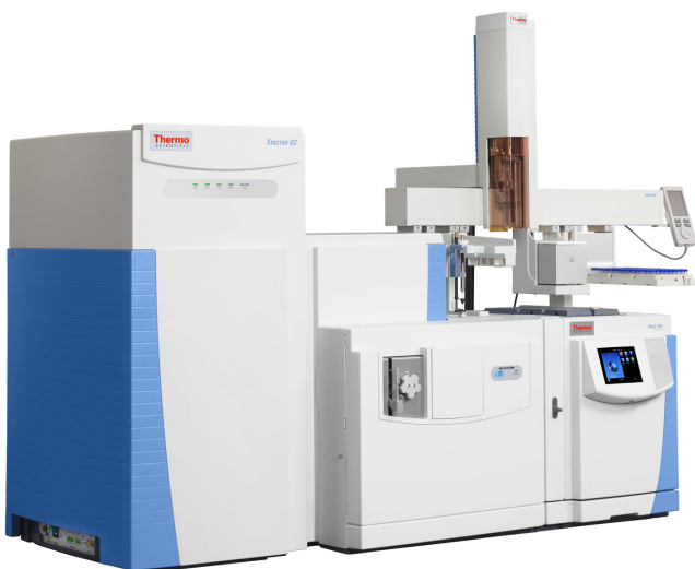
Exacte GC mass spectrometer with TriPlus RSH autosampler.